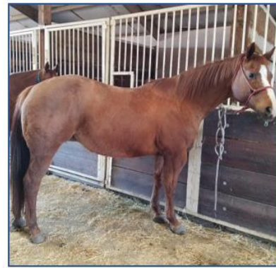
Leos Barron Red – 2003 Chestnut AQHA Mare