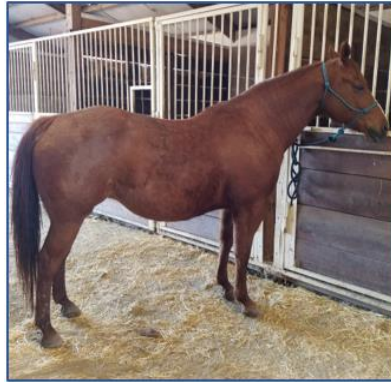
CD Sweet Hickory Pep – 2006 Sorrel AQHA Mare

Out of My Past Herd Sire that is Now working in the Neville Herd in Burwell